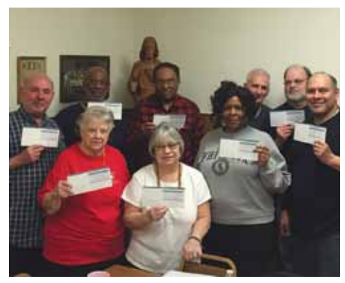
Campaign Executive Committee members at St. Bride Parish with their commitment cards.

Eight smaller parishes participating in Wave V have been grouped together in a "wave within a wave," and their pastors are enjoying the camaraderie the situation is providing.