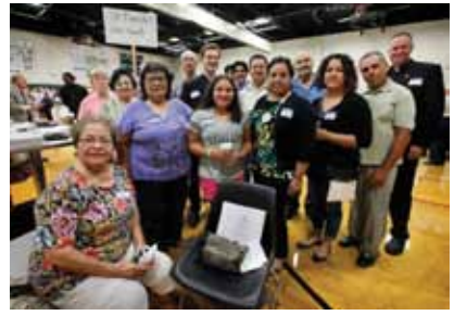
Wave VI parish orientations were held earlier this month at Our Lady of Perpetual Help Parish in Glenview, St. Alexander Parish in Palos Heights, and St. Nicholas of Tolentine Parish in Chicago. More than 1,500 parish leaders attended, and will serve as Campaign Executive Committee members and assist their pastors in carrying out the campaign in their parishes.