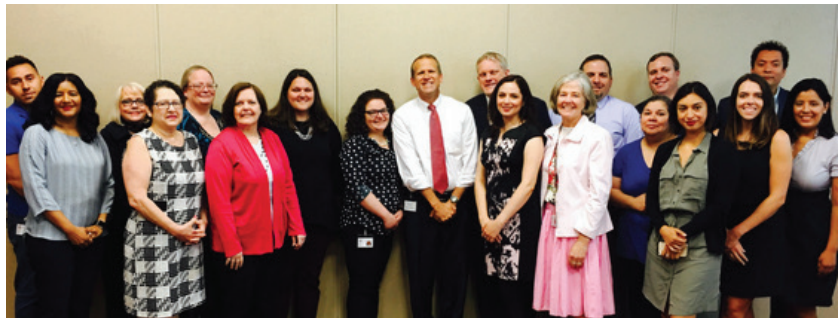
The Archdiocese of Chicago Stewardship and Development staff.

S&D has been given an opportunity to be transparent with donors and showcase the impact of the largest capital campaign in the history of the Church. We've made efforts to steward and engage with each donor at a direct and honest level, taking time to express our gratitude, and because of this, we have seen an improvement in our response rate and relationships.