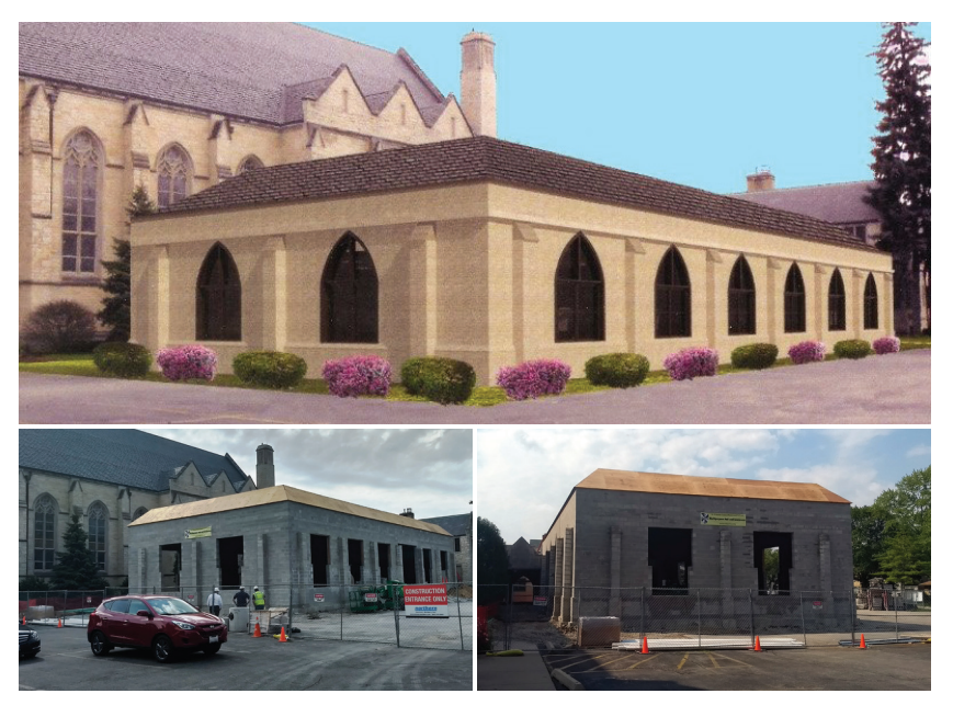
Above are recent images and an artist's rendering of Kyte Hall, a multipurpose space that will also serve as a lunchroom for the parish's school.

Established in 1931, St. Vincent Ferrer Church is one of several Dominican parishes in the Chicagoland area. The parish reach spans across the southern half of Elmwood Park and the northern half of River Forest, and is home to more than 1,000 people who attend mass on a weekly basis and 283 students enrolled at the parish's school.