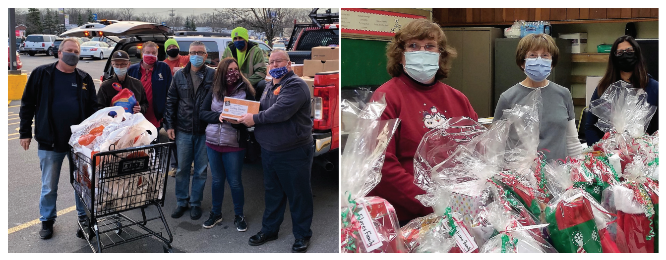
The parish received a grant from the archdiocese COVID-19 Relief Fund allowing their Family Assistance Ministry program to continue.

In order to meet their goal, the campaign committee reached out to parishioners with campaign presentations, personal calls, mailings, and through the bulletin and parish's website. To date, St. Pius X parish has completed the renovations on the organ, paid down a large portion of parish debt, and made repairs to the roof and chimney.