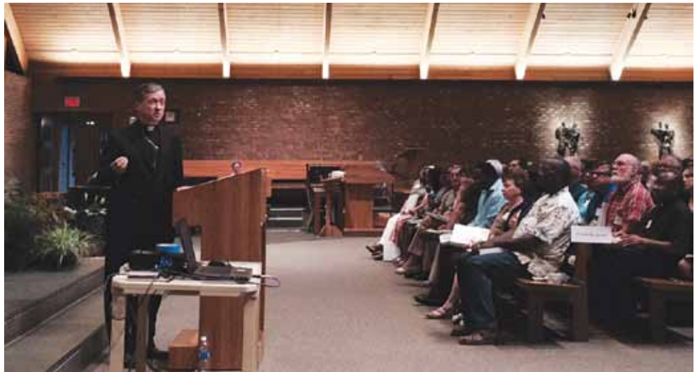
Archbishop Cupich addresses To Teach Who Christ Is volunteers at St. John of the Cross Parish in Western Springs.

"We can make a difference here," he told those gathered for an orientation meeting at St. Patrick Parish in Lake Forest on July 28. "Let's all join together ... to do something important. My hope would be that we would create a partnership here tonight. I can't do this alone."