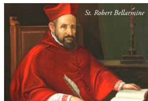
St. Robert Bellarmine

Scholarship awards from the St. Robert Bellarmine Catechetical Education Scholarship Fund will be made to qualified applicants as income from this endowment is available.