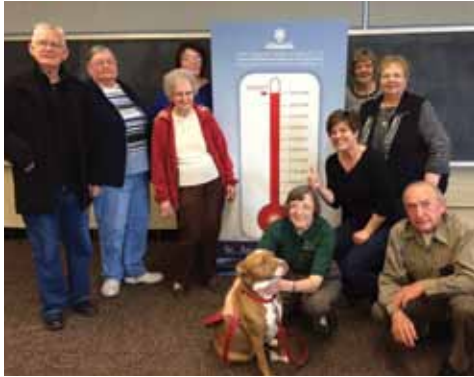
St. Andrew's CEC members celebrate their campaign's success with the parish dog, Lulu.