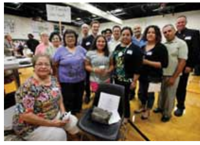
Wave VI parish orientations were held earlier this month at Our Lady of Perpetual Help Parish in Glenview, St. Alexander Parish in Palos Heights, and St. Nicholas of Tolentine Parish in Chicago. More than 1,500 parish leaders attended, and will serve as Campaign Executive Committee members and assist their pastors in carrying out the campaign in their parishes.