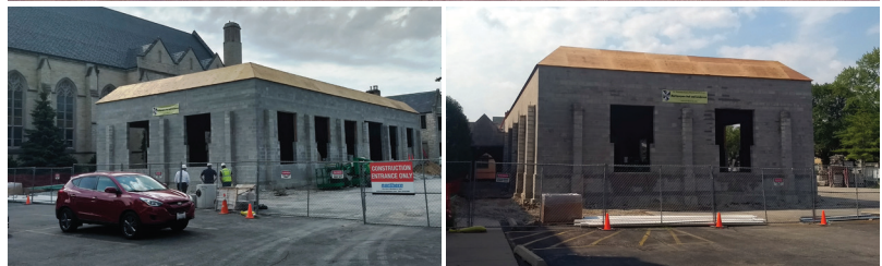
Above are images and an artist's rendering of Kyte Hall, a multipurpose space that was recently built at St. Vincent Ferrer parish that will also serve as a lunchroom for the parish's school.