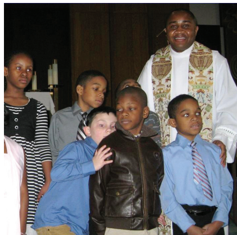
St. Jude the Apostle Parish plans to start a youth ministry program with campaign funds.

St. Jude the Apostle Parish has been in desperate need of a new boiler system — and the funds to pay for it. Thanks to the To Teach Who Christ Is campaign, the South Holland parish will warm its church and much more.