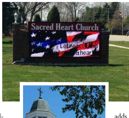
Sacred Heart's new sign and St. Patrick's new roof are thanks to generous gifts to the To Teach Who Christ Is campaign.

St. Patrick will also use its share of campaign funds to remodel the O'Gara Center, restore the stained glass windows and install air conditioning in its older church, improve lighting throughout the campus, and enhance several ministry programs.