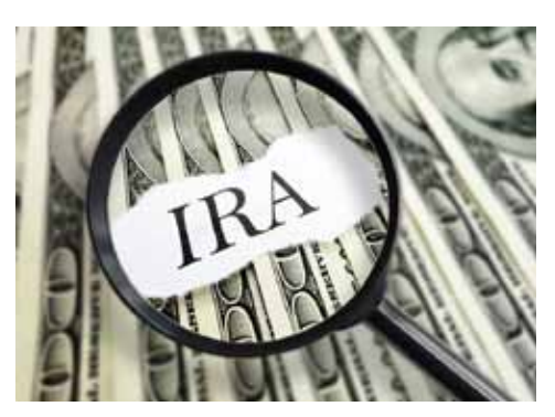
Congress extended and made permanent the IRA Charitable Rollover Tax Law at the end of 2015.

To take advantage of the IRA charitable rollover law, you must be 70<sup>1</sup>/<sub>2</sub> or older. In addition, qualifying distributions to charity are limited to