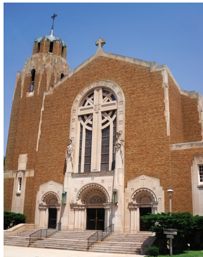
The story of success at Latino parishes through the To Teach Who Christ Is campaign is one of faith and strength. Above is a photo of St. Genevieve at 4835 West Altgeld Street.