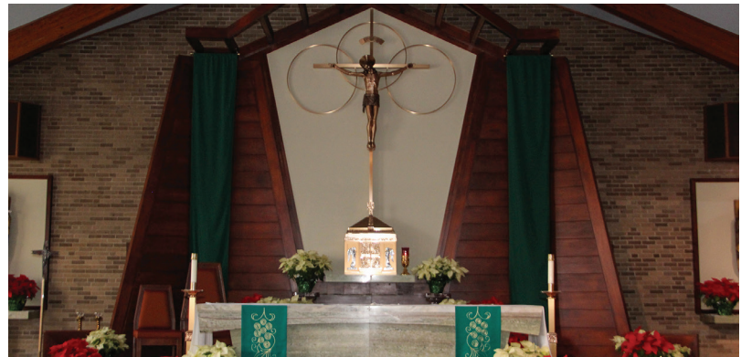
St. Alexander opened its doors to a newly renovated church at the end of 2017. Updates were significant and ranged from new kneelers and drywall to new stained glass windows and a new tabernacle.