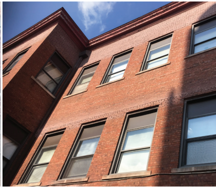
Before and after photos showing emergency repair work done at Epiphany Parish.

coaching programs to help Catholic school teachers continue to develop and grow in their careers and offer formation and training for principals.