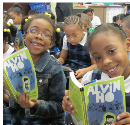
Students reading at St. John de la Salle School in Chicago.

The archdiocese's Catholic Schools take pride in the quality of education offered to more than 78,000 students, which is why a portion of the donations from the campaign went towards programs that allow students and staff to continue achieving academic excellence. Through the proceeds of the To Teach Who Christ Is campaign, $3.6 million have been used to provide resources and training for educational programs, support standards-based teacher