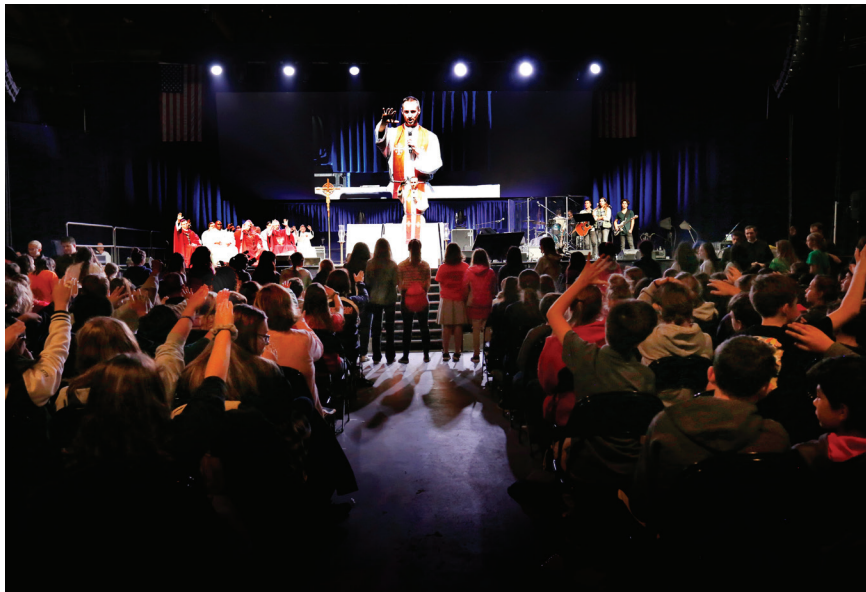
Holy Fire at the UIC Pavilion.

A few specific initiatives funds are allocated to include, My Catholic Faith Delivered ( mycatholicfaithdelivered.org ), the online catechist certification program that provides a flexible platform to achieve Archdiocesan certification. In addition, donations were put towards the launch of several youth retreats and programs, allowing the future of the Church to spend time with the Lord and grow with one another.