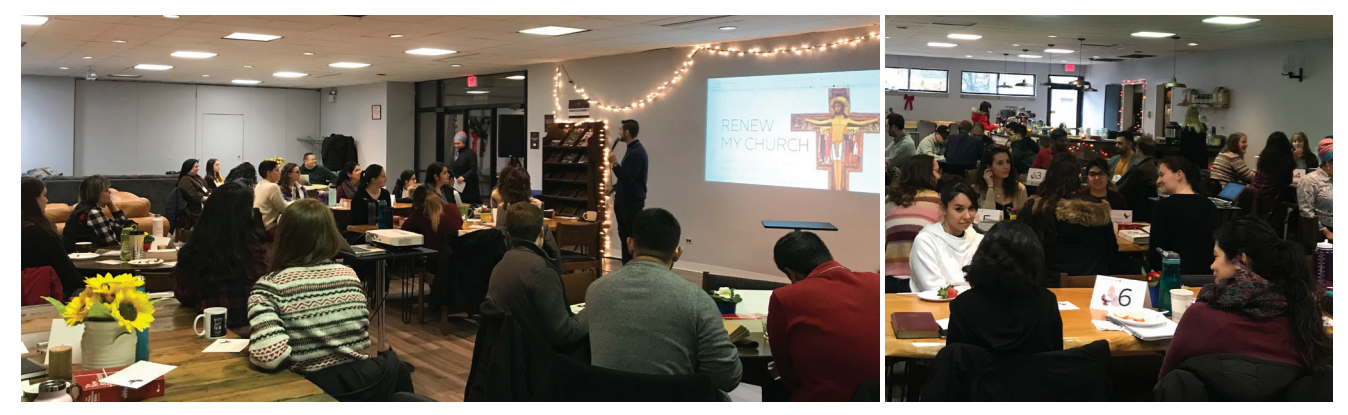
The YAET also hosts School of the Spirit, a formation program that focuses on four pillars: intellectual, pastoral, spiritual and human. Above are images from before the pandemic at the UIC Newman Center.

Some of the specific ways we've been able to reach young adults the past couple of years include: