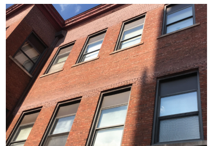
Before and after photos showing emergency repair work done at Epiphany Parish.

No money donated to the To Teach Who Christ Is campaign has been or will be used to defray expenses related to misconduct issues.