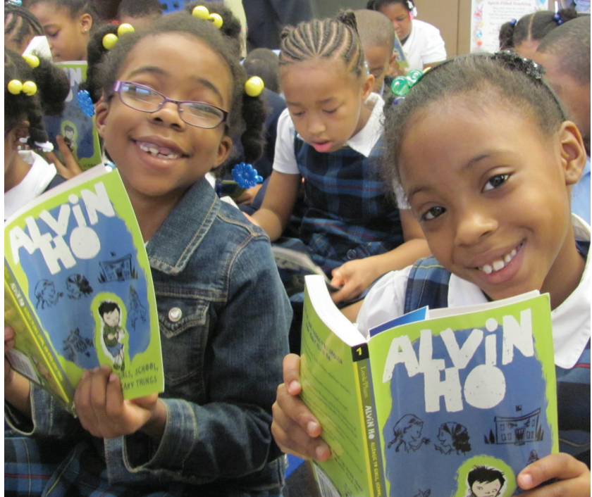
Students reading at St. John de la Salle School in Chicago.

The remaining $137.7 million pledged is committed toward the Trust. Since 2016, more than 1,700 Phoenix Scholarships have been awarded from the Trust for an average of $1,550 per student. As the Trust grows, the intention is to award additional, and hopefully larger, scholarships over time.