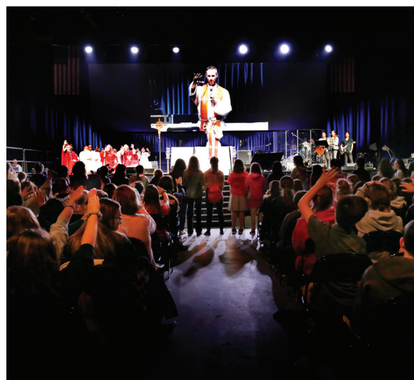
Religious education instruction at St. Mary Parish in Lake Forest (top). Holy Fire at the UIC Pavilion (bottom).