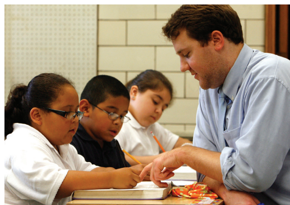
Fourth-grade teacher assists students with math questions at St. Frances of Rome School in Cicero.