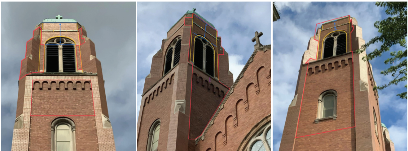
Pictured above are images of the updated north and south tower of Jesus, Shepherd of Souls Parish in Calumet City. The colored lines highlight the changes made to the towers.

On July 1, 2019, To Teach Who Christ Is parishes, St. Victor, St. Andrew the Apostle and Our Lady of Knock united together through Renew My Church to form Jesus, Shepherd of Souls Parish in Calumet City. Both St. Andrew, located at 768 Lincoln Avenue in Calumet City, and Our Lady of Knock, located at 501 163rd Street, were left open as worship sites.