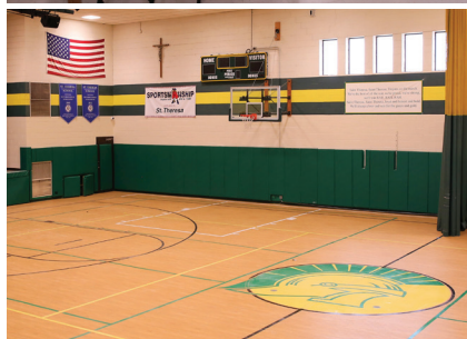
Pictured above are renovations St. Theresa Parish made following the success of their campaign.