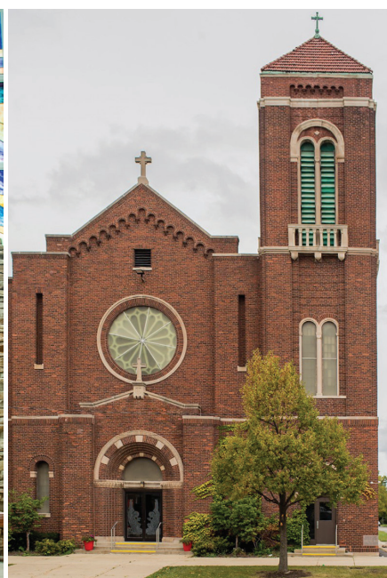
Pictured above from left to right are Most Blessed Trinity's worship sites: Immaculate Conception, including the two-story pillars the parish repaired with funding, Holy Family and Queen of Peace.

Most Blessed Trinity Parish is the largest parish in the archdiocese with a pre-Covid weekend mass attendance of more than 6,000 individuals at 13 masses. The parish's mission is to serve the people of God, with a preferential option for the poor: To walk with Jesus is to walk with the poor.