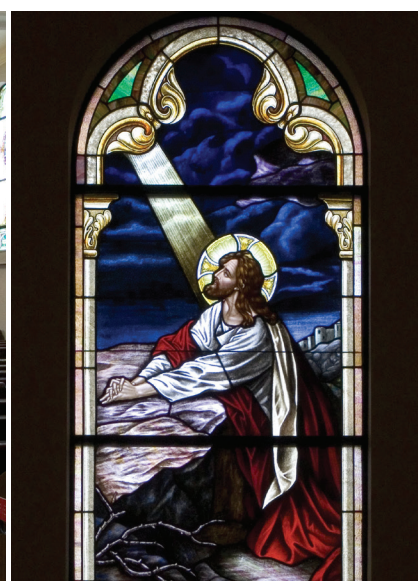
Pictured above are images of St. Florian Parish which is now the worship site for Christ Our Light Parish.

Through the Archdiocese of Chicago's Renew My Church movement, St. Columba, St. Florian and Mother of God parishes united together to form Christ Our Light Parish. Christ Our Light Parish strives to provide a sense of justice, responsibility, prayerfulness, community, and unity to its parishioners and the local community. The parish is currently in the "Building the New Reality" phase of the Renew My Church movement. In that phase they aim to enhance parish life and build community by encouraging active participation in dialogue, evangelization, stewardship, prayer and love. The existing parishes officially unified on Easter Sunday, April 13, 2020, and St. Florian, located at 13145 S. Houston Avenue in Chicago, serves as the parish church.