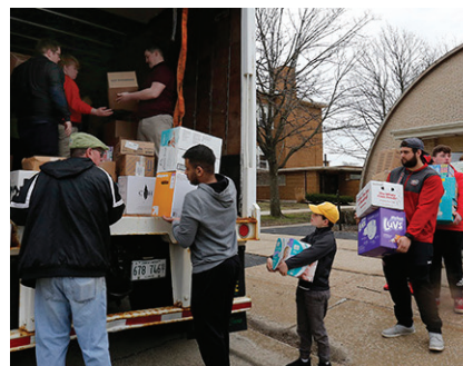
Pictured above are volunteers at St. Bernadette Parish in Evergreen Park loading a truck with donated goods.

To learn the many ways you can support Ukraine, please visit the Archdiocese of Chicago's website at archchicago.org .